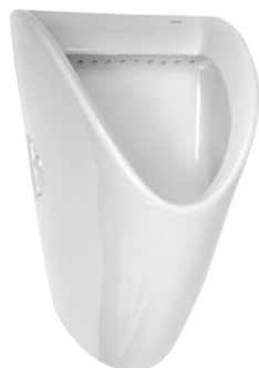
SLP 27 - Roca - Chic